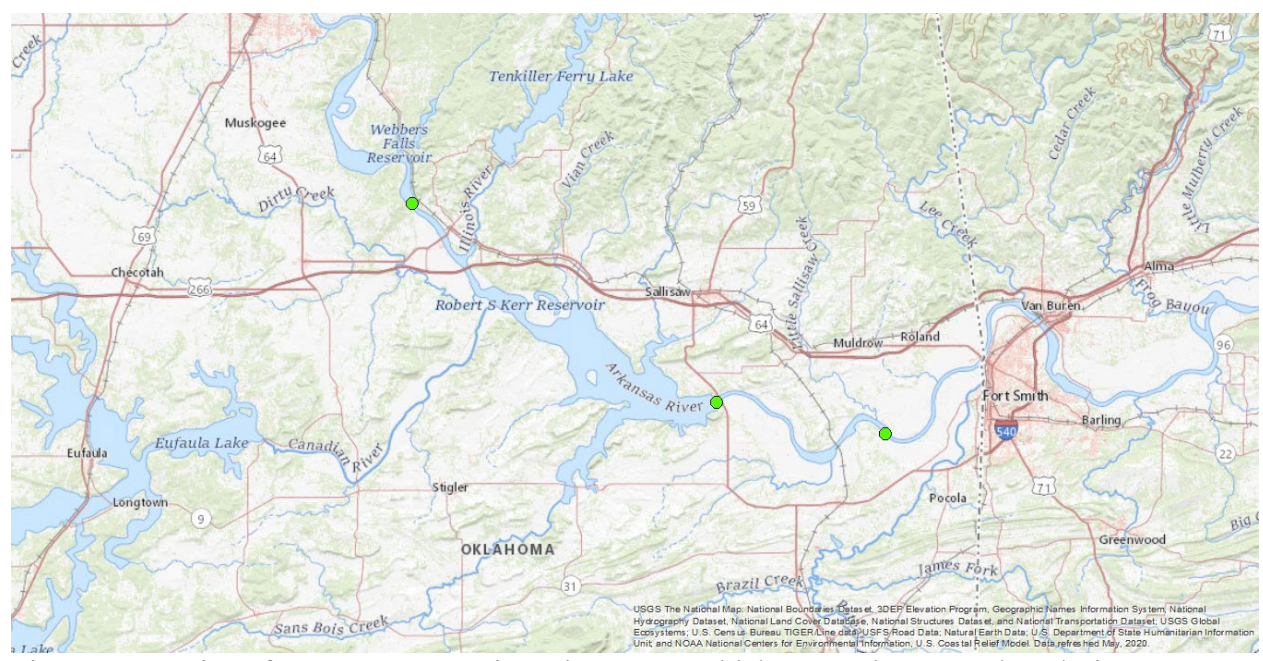
Figure 2 Locations for VEMCO Receivers in eastern Oklahoma. The green dots designate monitoring sites. Sites from west to east include Webbers Falls Lock and Dam 16, RS Kerr Lock and Dam 15, and WD Mayo Lock and Dam 14.