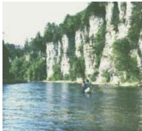
View of the Iowa River.

2) San Mateo Creek (California): Natural treasures should be enjoyed, not buried under millions of tons of concrete. While that might seem like common sense, it apparently isn't to California's Transportation Corridor Agencies (TCA), which are