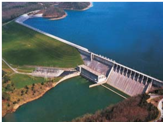
Wolf Creek Dam and Lake Cumberland Kentucky.

Wolf Creek Dam, along with Dale Hollow Dam, Center Hill Dam and J. Percy Priest Dam, provide water to enhance navigation on the mainstem