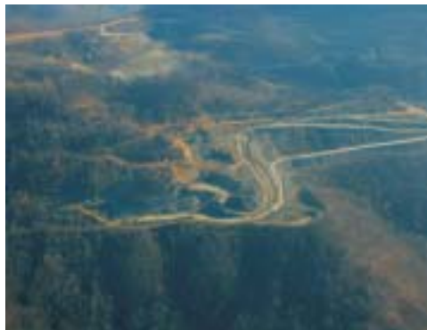
Mountaintop Removal in Tennessee.

"The Corps has evaluated the physical structure of the streams and partially considered impacts to those streams as habitat, but has given no more than lip service to the other attributes of headwaters that must be considered in assessing the structure and function of a stream," he wrote. The permits, issued to